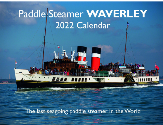
2022 Waverley Calendar

Treat yourself to a special memento of your cruise aboard Waverley and visit the Shop. Pick up a gift from the wide range of exclusive souvenirs including clothing, homewares, books, stationery and much more. Every purchase from Waverley's Shop helps support her continued operation.