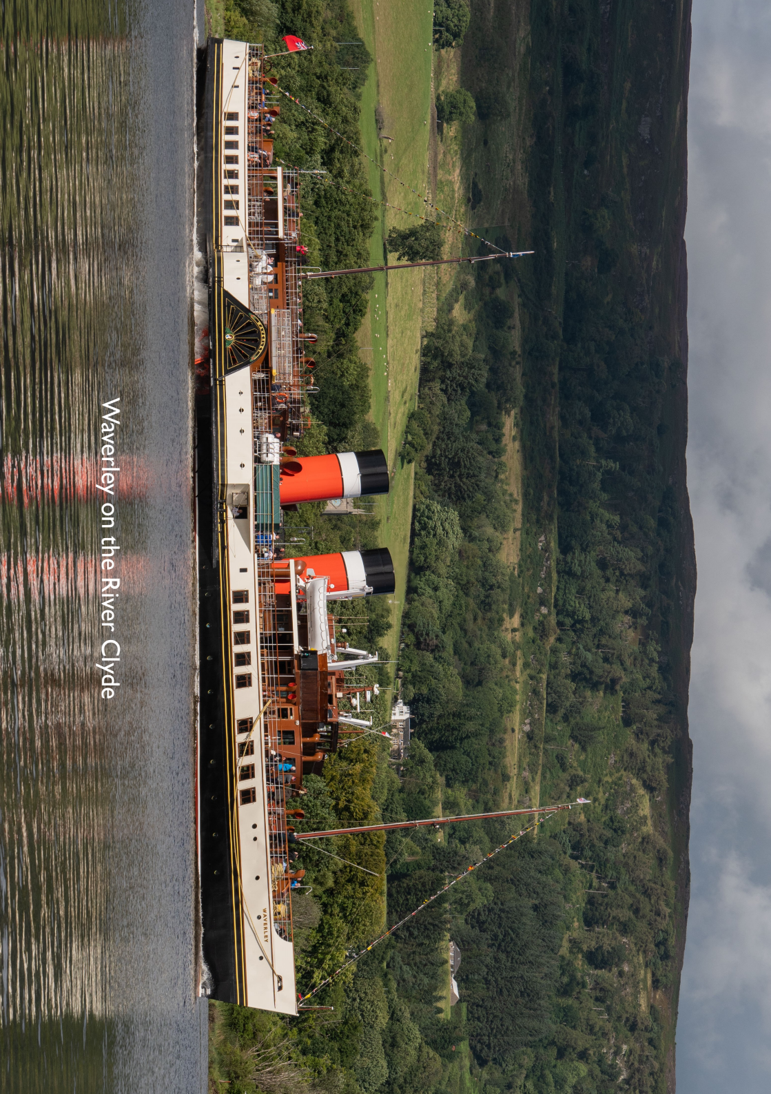
Waverley on the River Clyde