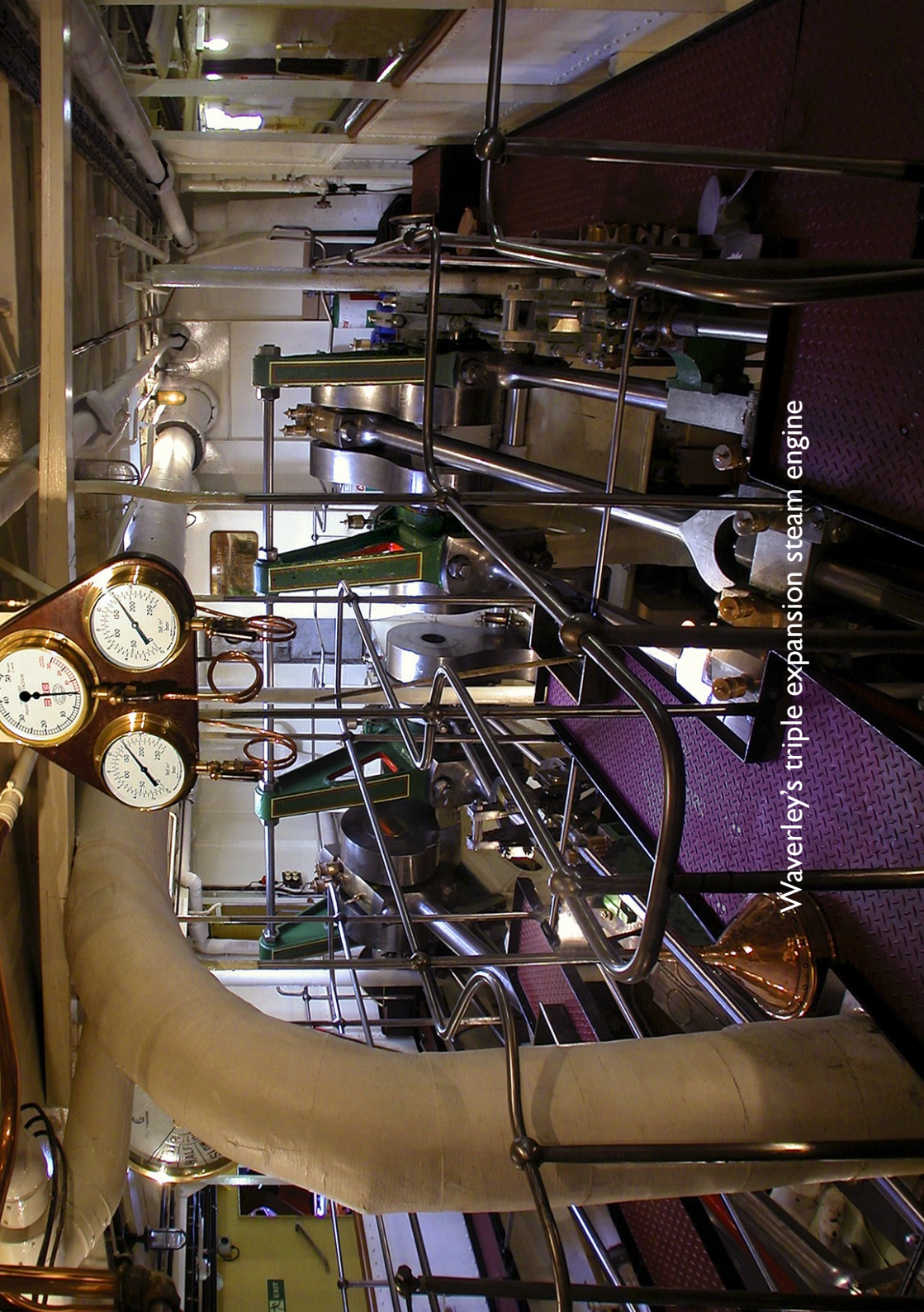
Waverley's triple expansion steam engine