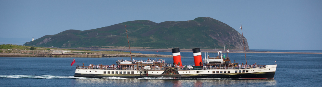
Paddle Steamer Waverley is proudly owned by a registered charity and operated on a not-for-profit basis in association with the Paddle Steamer Preservation Society.