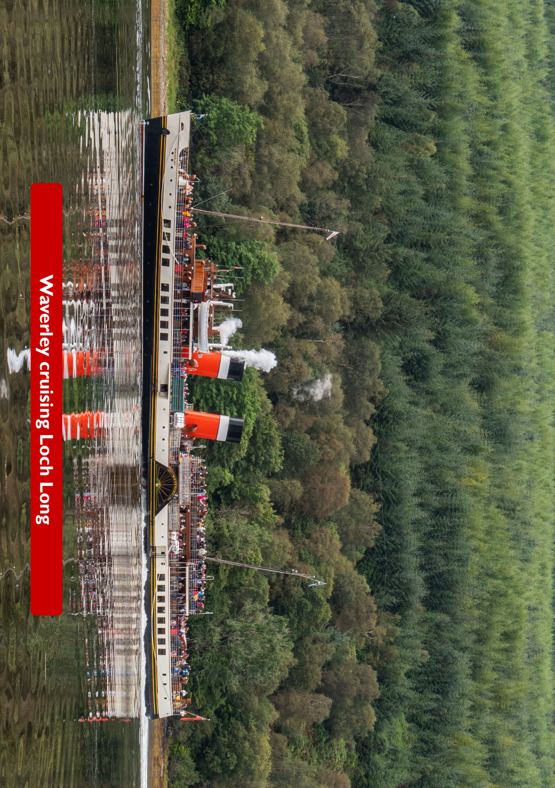
Waverley cruising Loch Long