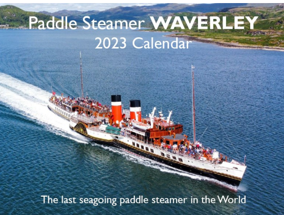
2023 Waverley Calendar

Treat yourself to a special memento of your cruise aboard the iconic Waverley and visit the Souvenir Shop. Pick up a gift from the wide range of exclusive souvenirs including clothing, homewares, books, stationery and much more. Every purchase from Waverley's Shop helps support her continued operation.