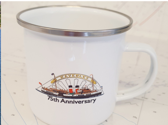
75th Anniversary Range