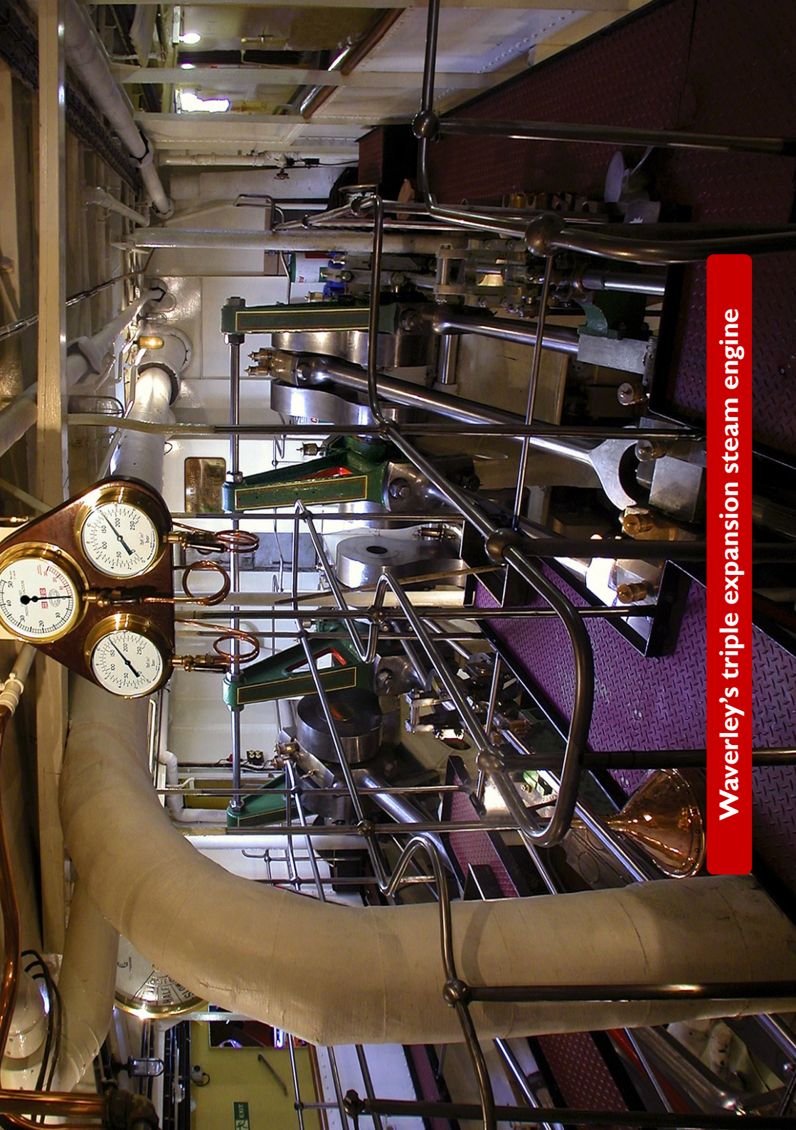
Waverley's triple expansion steam engine