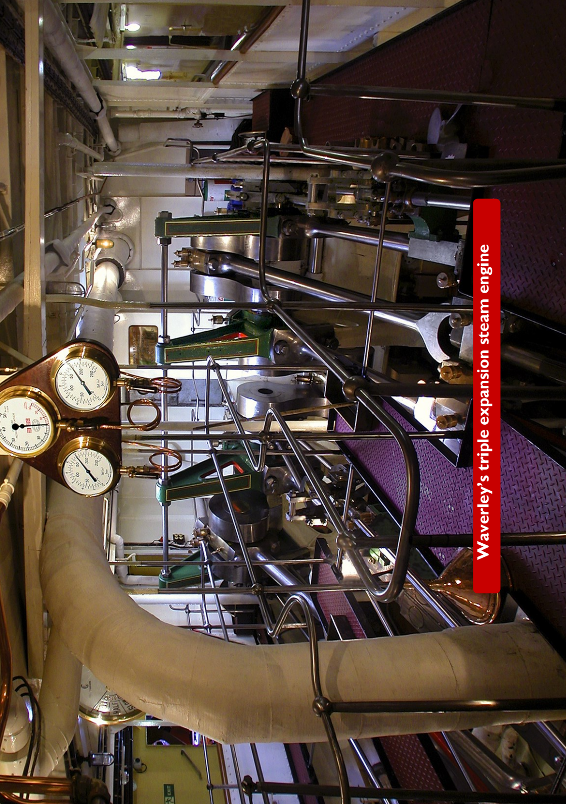
Waverley's triple expansion steam engine