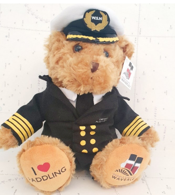
Captain Eddie Bear