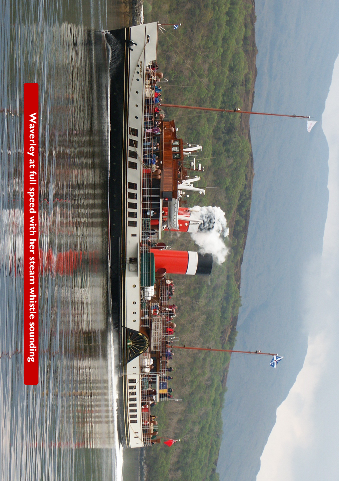
Waverley at full speed with her steam whistle sounding