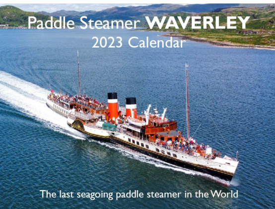
2023 Waverley Calendar

Treat yourself to a special memento of your cruise aboard the iconic Waverley and visit the Souvenir Shop. Pick up a gift from the wide range of exclusive souvenirs including clothing, homewares, books, stationery and much more. Every purchase from Waverley's Shop helps support her continued operation.