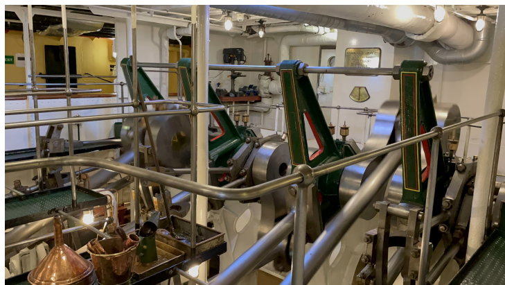
Waverley's triple expansion steam engine - open to view

Aboard Waverley you can experience a 'touch of nostalgia' as you step back in time aboard the last seagoing paddle steamer in the World. Marvel at the magnificent triple expansion steam engine driving the ship's massive paddles, dine in the self-service restaurant, enjoy a refreshment in one of the period lounges, buy an exclusive souvenir at the on-board shop or simply enjoy the passing scenery aboard this famous steamship.