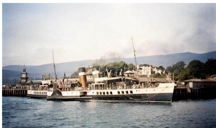
Waverley at Dunoon in 1947

Paddle Steamer Waverley will return to service this summer and celebrate the Diamond Jubilee of her maiden voyage which took place on June 16, 1947.