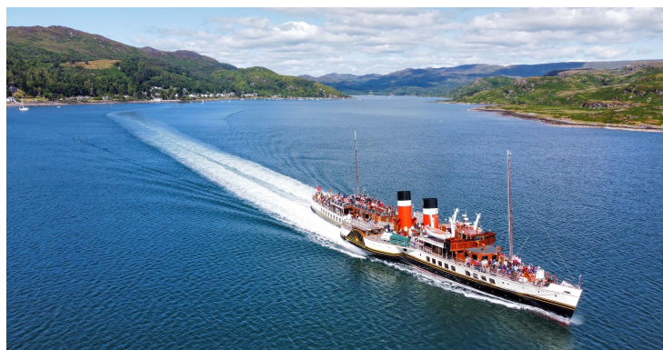
Cruise the stunning Kyles of Bute

Donate online now at waverleyexcursions.co.uk or call 0141 243 2224.