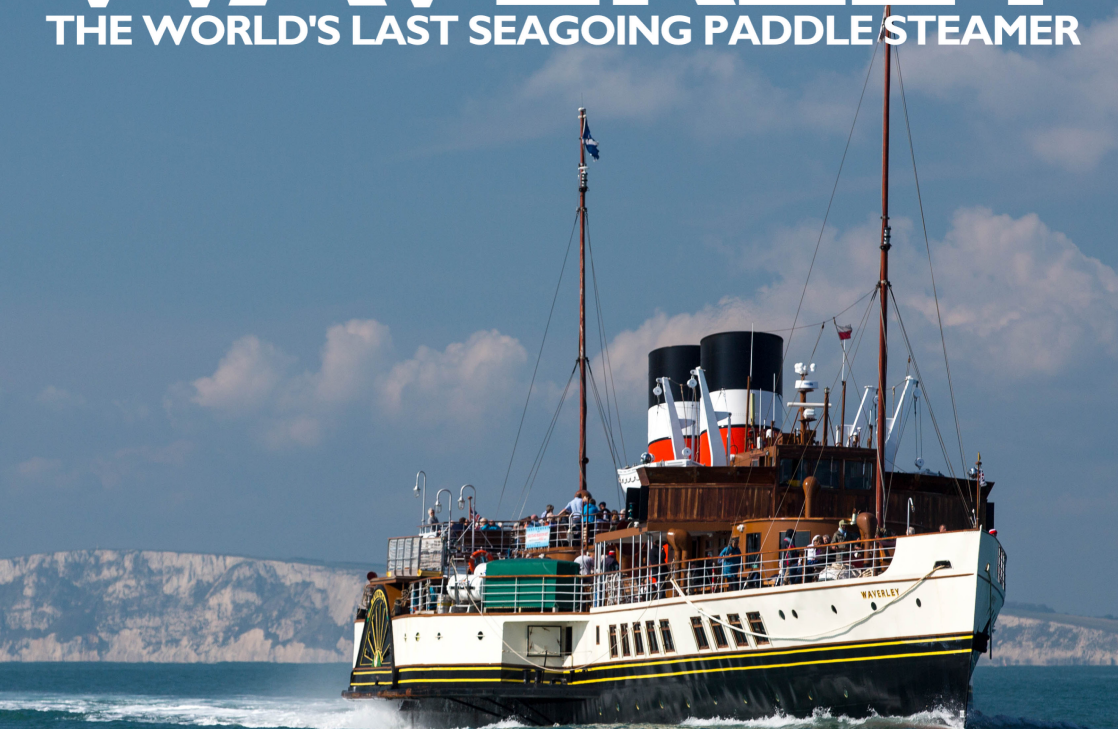
CHART A COURSE FOR WAVERLEY'S FUTURE