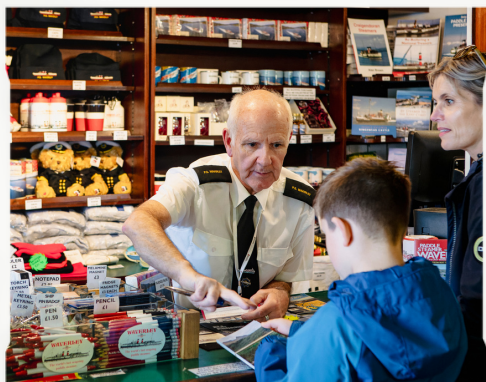
Waverley's Souvenir Shop is bursting with a range of exclusive gifts and mementos

Children (5-16) go for half fare on most cruises, on some cruises kids go for just £1, on all cruises under 5s travel for FREE.