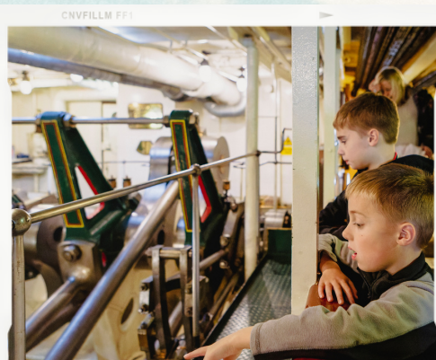
Waverley's Steam Engine - is open to public gaze and wonderment as it drives the ship's massive paddle wheels

As the “Sole Survivor”, Waverley boasts a rich history and showcases a magnificent triple expansion steam engine that will leave you in awe. Experience the authentic charm of a real steamship as you hear the telegraph ring, witness the engine's graceful motion and sense the gentle aroma of hot oil and steam. You can even watch the paddles turning.