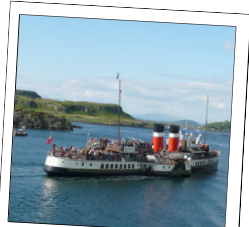
Don't miss the opportunity to step aboard the famous Paddle Steamer Waverley