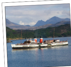
Waverley returns to Oban & the Inner Hebrides for 8 days only!