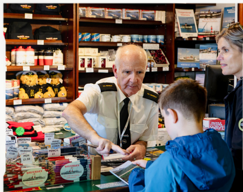
Waverley's Souvenir Shop is bursting with a range of exclusive gifts and mementos

The 2024 South Coast sailing programme builds on the exceptional success of 2023 with Waverley operating from Weymouth (Portland), Swanage, Poole, Yarmouth, Ryde, Southampton, Portsmouth, Shoreham and for the first time in over two decades from Eastbourne - Thursday 13th September.