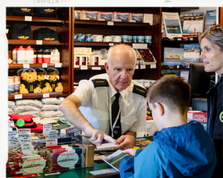
Waverley's Souvenir Shop is bursting with a range of exclusive gifts and mementos

Tickets for all sailings can be booked in advance online at waverleyexcursions.co.uk or by calling 0141 243 2224 or purchased on board when you sail.