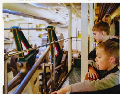
Waverley's Steam Engine - is open to public gaze and wonderment as it drives the ship's massive paddle wheels

Experience the authentic charm of a real steamship as you hear the telegraph ring, witness the engine's graceful motion and sense the gentle aroma of hot oil and steam. You can even watch the paddles turning.