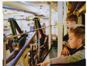
Waverley's Steam Engine - open to public gaze and wonderment as it drives the massive paddle wheels

Tickets for all sailings can be booked in advance online at waverleyexcursions.co.uk or by calling 0141 243 2224 or purchased on board when you sail.